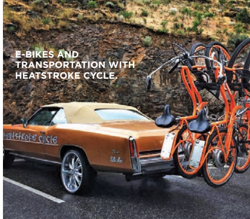
E-BIKES AND TRANSPORTATION WITH HEATSTROKE CYCLE.

Over the past two decades, the Okanagan Valley has emerged as British Columbia's premier wine region, and 44 of the valley's 120 wineries are between Osoyoos and Oliver, about 12 miles north. A guided, half-day electric bicycle tour with HEATSTROKE CYCLE & SPORT allows us to discover the diversity of the southern valley's most-appealing varietals. In the rustic tasting room at BARTIER BROS. winery, for example, we detect hints of honey and peach in a gewürztraminer-chardonnay blend. At BLACK HILLS ESTATE WINERY'S WINE EXPERIENCE CENTRE , the luscious intensity of the signature Nota Bene blend of red Bordeaux varietals is as dazzling as the swanky setting, which includes a poolside deck that overlooks the valley. (The pool is not available for swimming.) Memorable selections at the stately BURROWING OWL ESTATE WINERY include a pinot gris offering hints of stone fruit, which prove refreshing on this 85-degree day, and a rich cabernet sauvignon-syrah blend. >> You should always designate a driver when wine tasting or find alternative transportation. For $85 Canadian ($68 U.S.), the hop-on/hop-off OK WINE SHUTTLE provides service from Osoyoos' major resorts to 15 wineries. (Some wineries charge an additional tasting fee.)